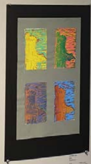
Small text caption below the artwork.