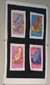
Small text caption below the artwork.