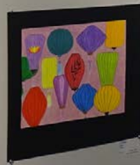
Small text caption below the artwork.