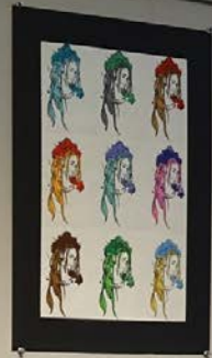
Small text caption below the artwork.