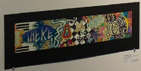
Small text caption below the artwork.