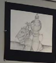
Small text caption below the artwork.