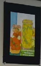
Small text caption below the artwork.