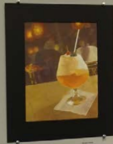
Small text caption below the artwork.