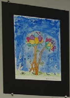
Small text caption below the artwork.