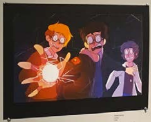
Small text caption below the artwork.