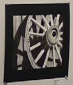
Small text caption below the artwork.